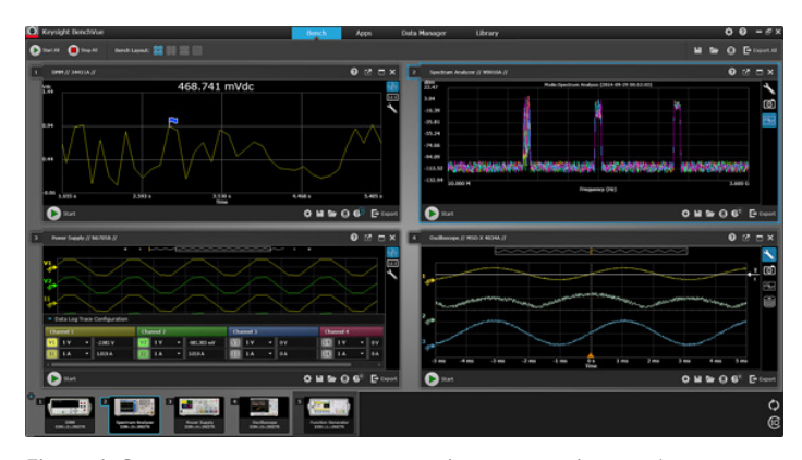
Figure 1. See your measurements across instruments in one place to quickly correlate measurement activities and obtain actionable insights.