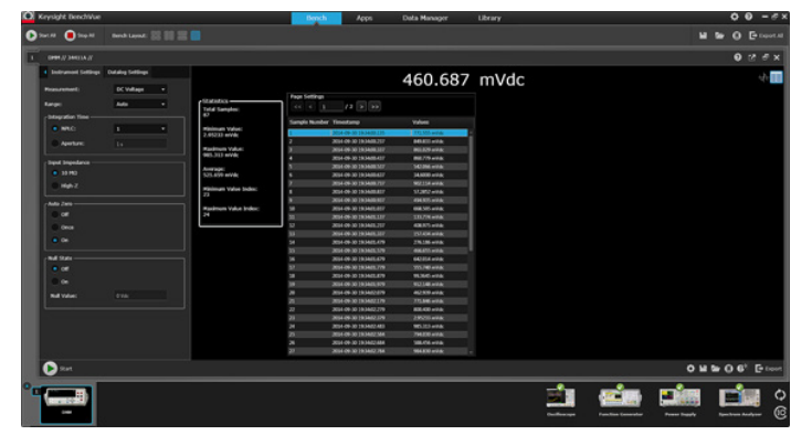
Figure 2. BenchVue enables control of your DMM to data log and visualize measurements in a wide array of display options.