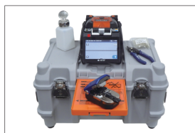
Carrying case with worktable CC-72