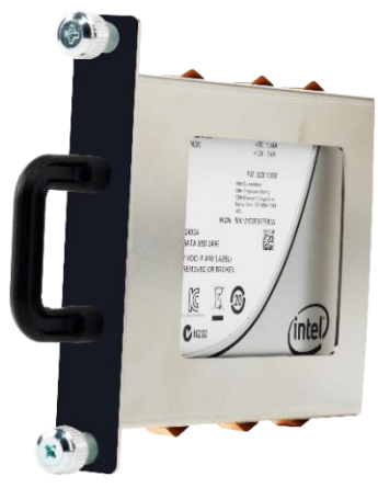
Figure 2. Front panel connections for M9037A